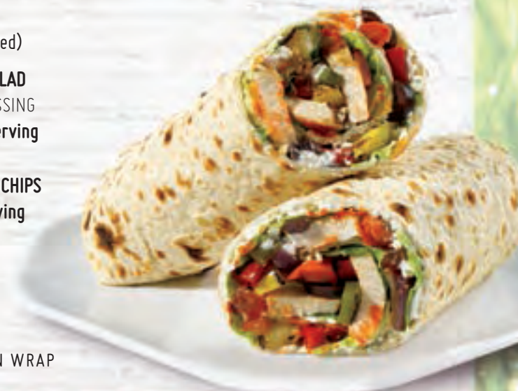
SUMMER CHICKEN WRAP