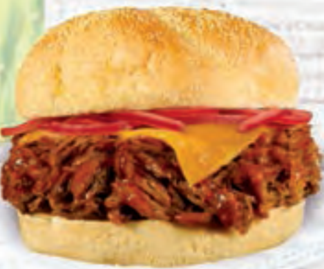
BBQ BEEF BRISKET

2000 CALORIES A DAY IS USED FOR GENERAL NUTRITION ADVICE, BUT CALORIE NEEDS VARY. ADDITIONAL NUTRITION INFORMATION IS AVAILABLE UPON REQUEST. IN THE INTEREST OF PUBLIC HEALTH, PLEASE BE AWARE THAT CONSUMING RAW OR UNDERCOOKED MEATS, POULTRY, SEAFOOD, SHELLFISH, OR EGGS MAY INCREASE YOUR RISK OF FOOD-BORNE ILLNESS, ESPECIALLY IF YOU HAVE CERTAIN MEDICAL CONDITIONS.